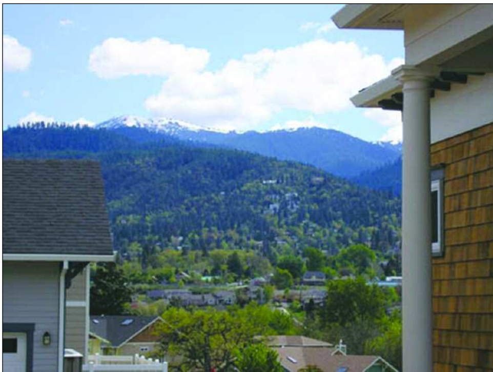
Morgan Hunt's writer's retreat window frames the peak of Mount Ashland.

Fingers plot, where the murder weapon is a snake. Her second guideline: Every one of her books will be short and enjoyable, no more than 50,000 words. Lastly, if there is going to be murder and pain, it will not be cheapened, and the loss of life will not be treated in a cavalier fashion; someone is going to feel it.